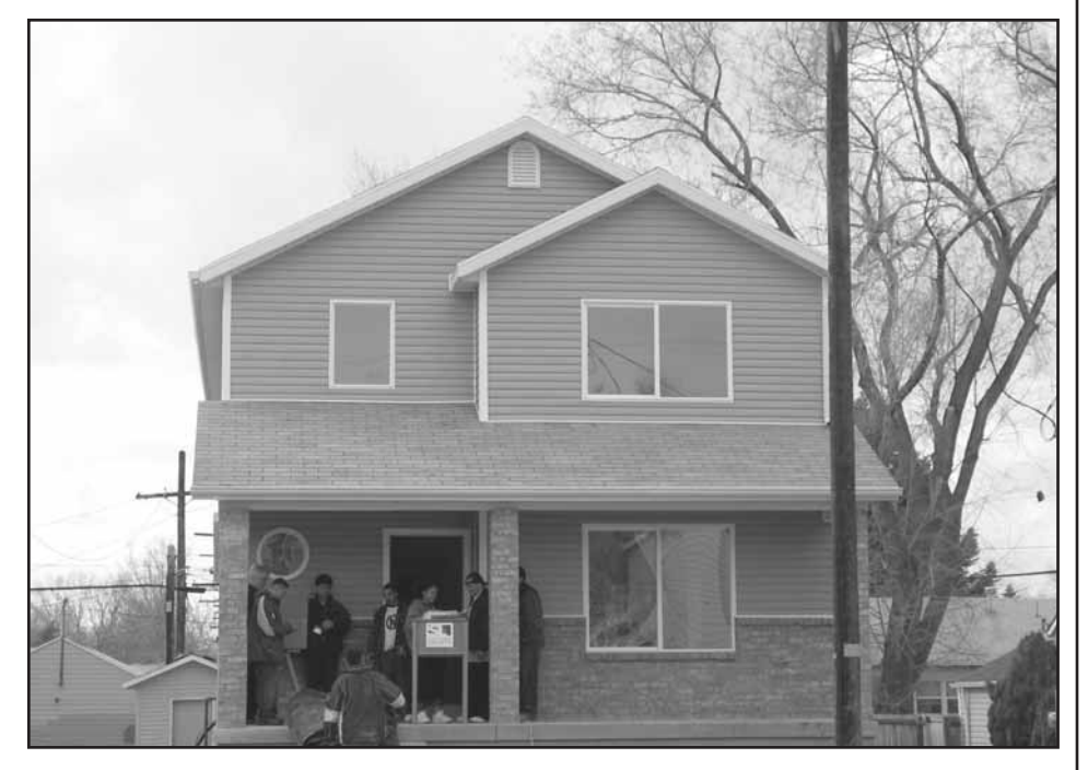
Students of YouthBuild stand outside the first house they completed after nearly a year of work.