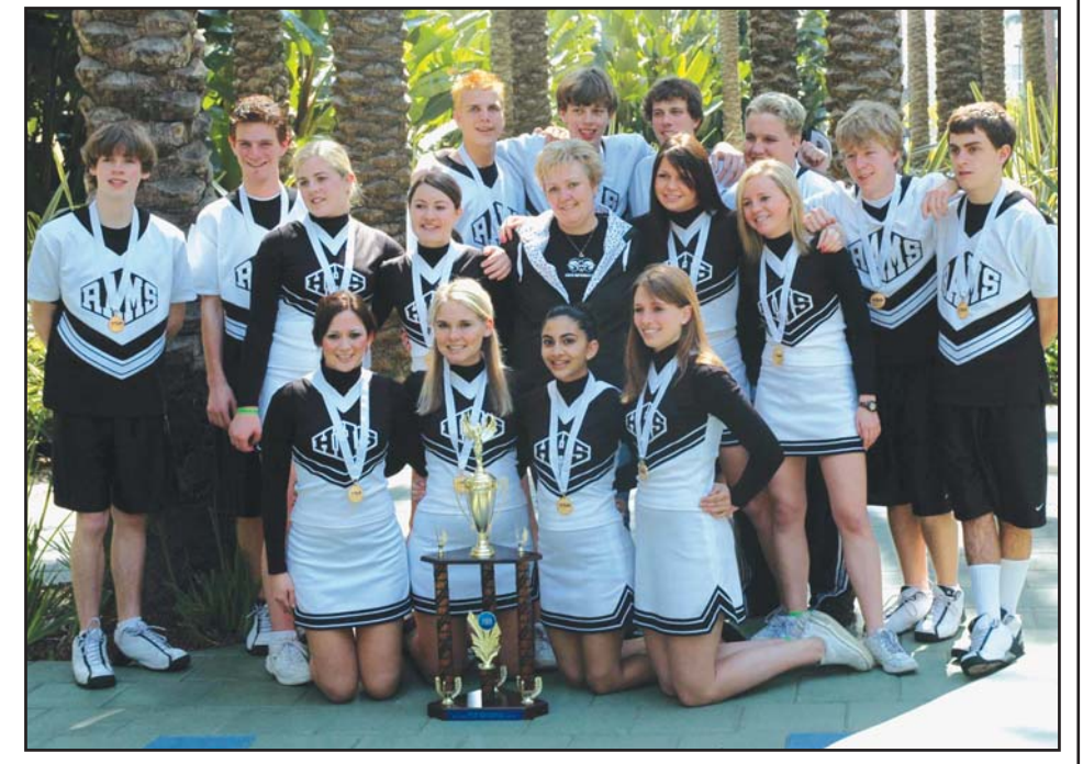
The Highland High cheerleading squad took third place in the USA Spirit Nationals.

Highland High cheerleading squad competes at nationals