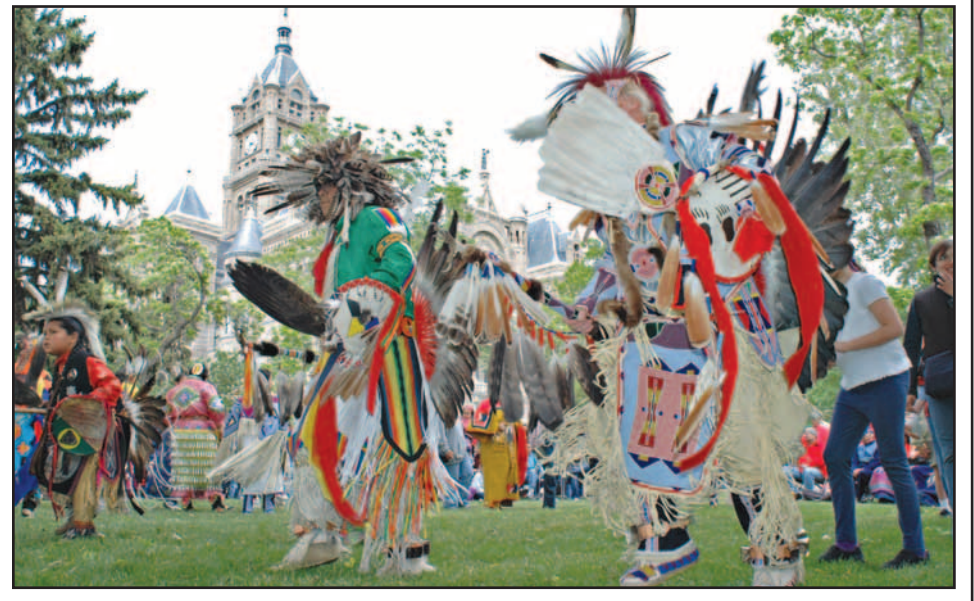
The Living Traditions pow-wow demonstration features many of Utah's Native American tribes.

Living Traditions Festival marks 20th anniversary of diverse community celebration