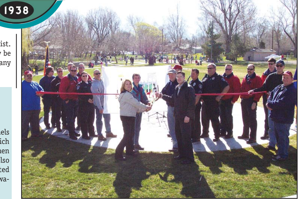
Mayor and City Council members join with city employees and residents for ribbon cutting ceremony at new Amphitheatre in Fitts Park. The new facility is ideal for plays, family gatherings and entertainment. Contact the parks department at 412-3217 to make your reservations!