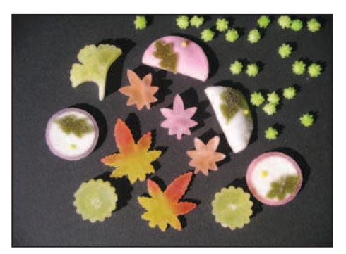
Japan Festival on April 30 will offer 'tastes' of the Orient for valley residents.

For more information on Living Traditions or to volunteer, call the Salt Lake City Arts Council at 596-5000 or visit the Web site at www.slcgov.com/arts. Admission is free.