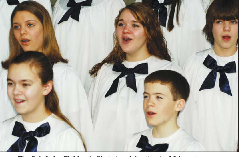
The Salt Lake Children's Choir is celebrating its 25th anniversary in May with two upcoming concerts.

The May 14 concert includes classical and folk song standouts from the