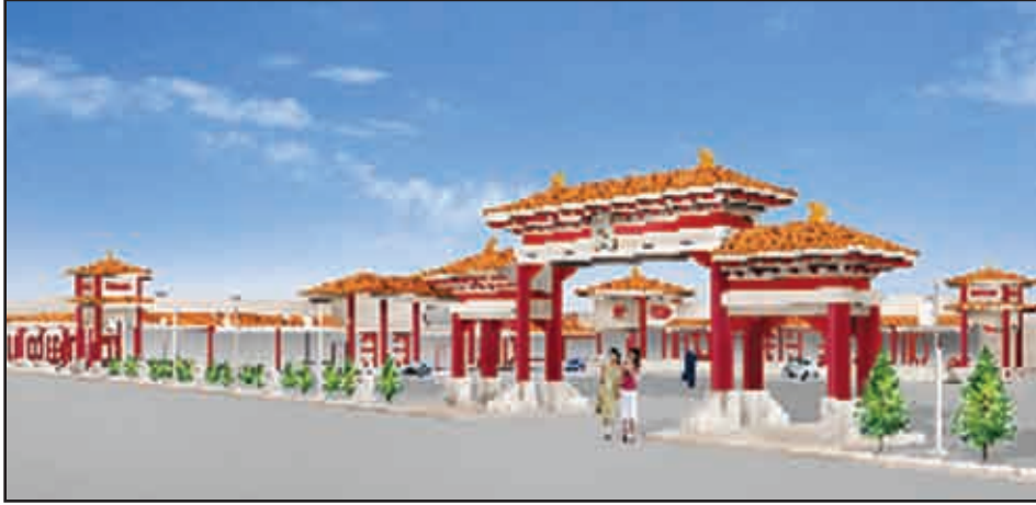
A conceptual drawing of what the proposed Chinatown development will look like when completed in early 2009.