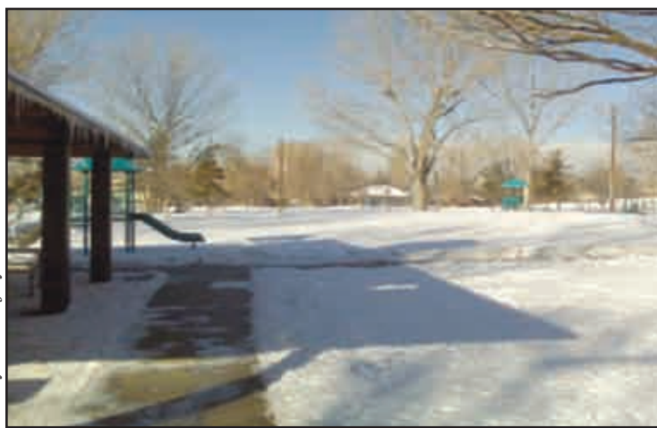
This area in the middle of Fitts Park (looking east) will soon be home to a new playground.