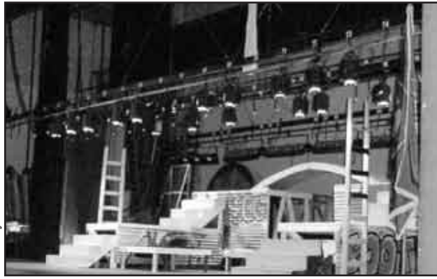
The set is all ready for Granite High School's production of "A Midsummer Night's Dream."

The students are enjoying rehearsing for the performance.